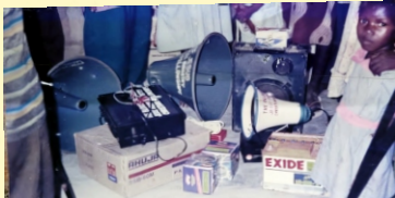
1st PA System for street Evangelism in 1995

1st - 5th year (1994 - 1999) in Igangan (1ST GENERATION OF JDM) To God be the glory.