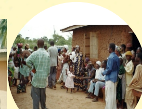
Medical mission trip by Doctors from Abeokuta