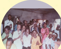
Church Service with PTLC (1996).