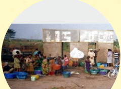
Rehoboth Borehole in operation after 10 years (2010)