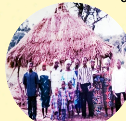
Olokete in 1998

"Go therefore and make disciples of all the nations, (ethnos) baptizing them in the name of the Father and the Son and the Holy spirit" Matthew 28 :19