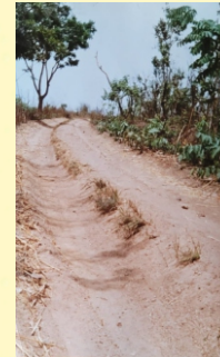
Dusty road to the interiors

(Ijebu waterside, Egba, Igede, Idoma and others 1994 - 2006)