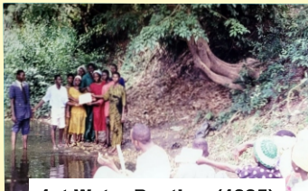
1st Water Baptism (1995)