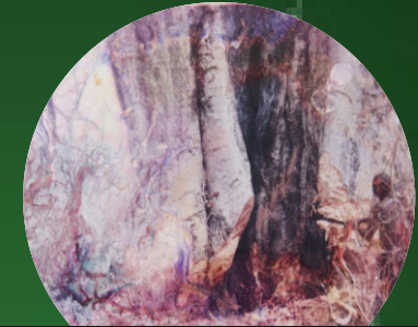
Sorry! photos were salvaged