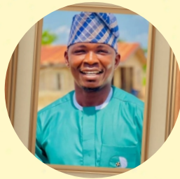
JDM YOUTH PASTOR.