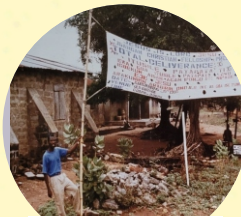
1st Crusade banner erected (1995)