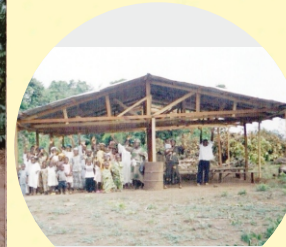
Ijebu - Waterside in 2002