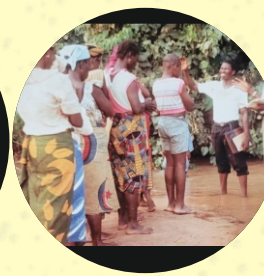
The Gwaris and Igala tribes.