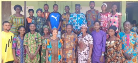
REHOBOTH GROUP OF SCHOOLS STAFF MEMBERS