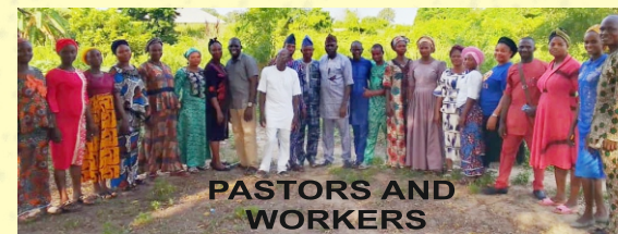
PASTORS AND WORKERS

"Then Jesus went about all the cities and villages, teaching in their synagogues, proclaiming the good news of the kingdom and healing every disease and sickness" Matt. 9:35