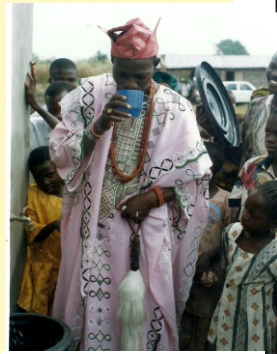
Rehoboth Borehole Commissioned by the Late King of Igangan in 2000