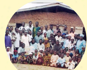
Abidioki in 2002