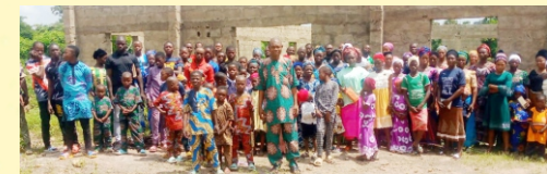
Abidioki 2024 in front of their uncompleted concrete Church building. HELP!